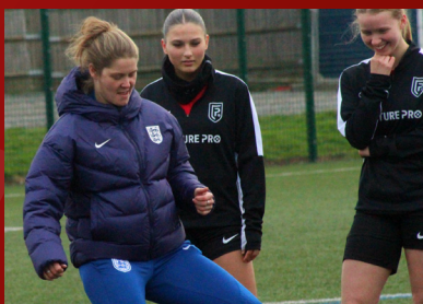
Working with England U17 Lionesses Coach