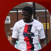
FELIX - Italy