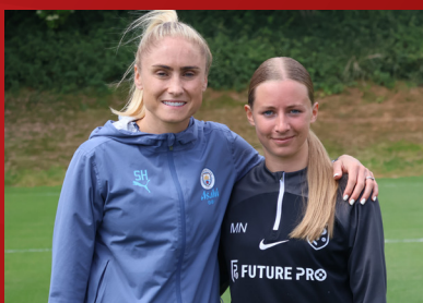
Coached by former WSL & International Player Steph Houghton at St George's Park