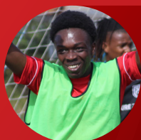
KAEL - France