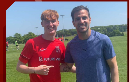
Training with the Pros at St George's Park Experience working with Ex Chelsea FC & Arsenal FC Professional 'Cesc Fabregas'

of players who play in the premier league are from overseas