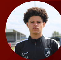
MARCO - Antigua