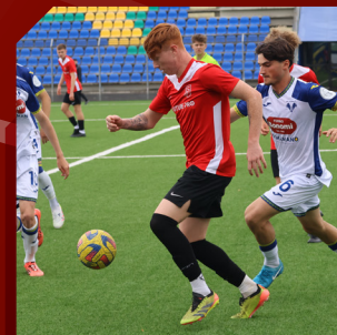
Professional Showcase Games Showcase vs Serie A Professional Academy Hellas Verona U18's