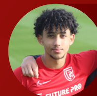
LANCE - Seychelles