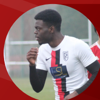
DESTINY - Spain