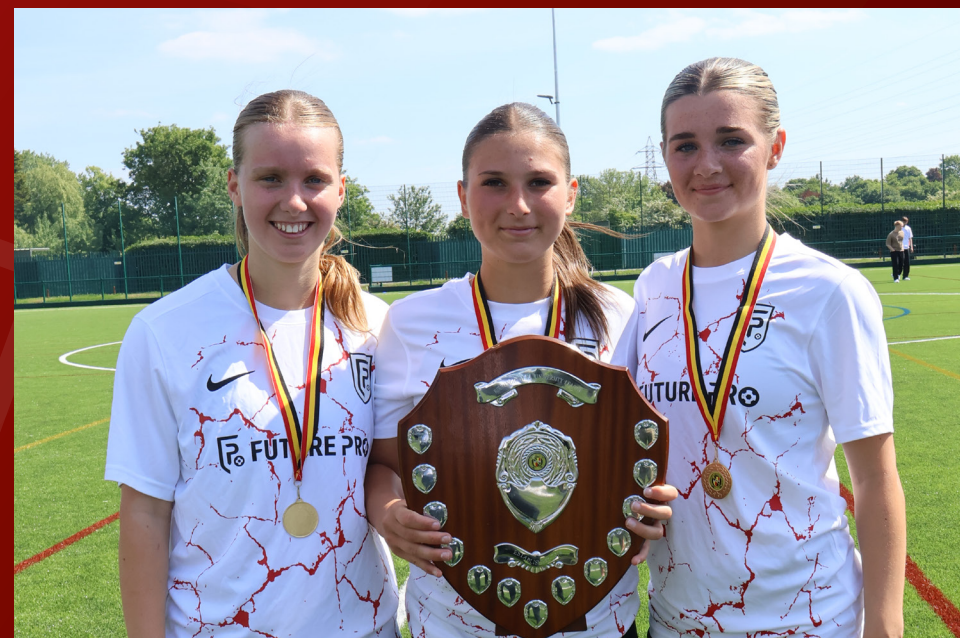
Won the U21 Regional Women's Cup