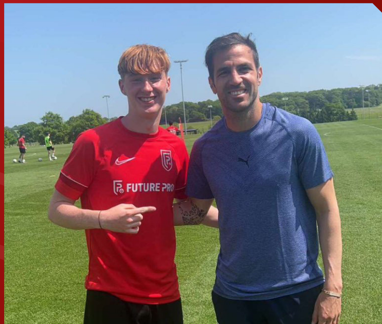
Working with Cesc Fabregas