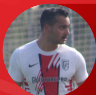
INDIE - Australia

We provide aspiring professional footballers the opportunity to progress to the next level from all around the world with our proven track record of producing professionals. Below are some examples of our current Academy members on our full-time football and education programmes amongst many more different nationalities making Future Pro a multi diverse inclusive football and education academy: