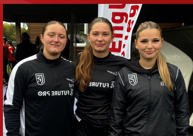
England College Trials at Chelsea FC Cobham Training Ground