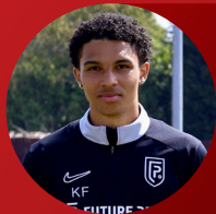
KENNAH - Bermuda