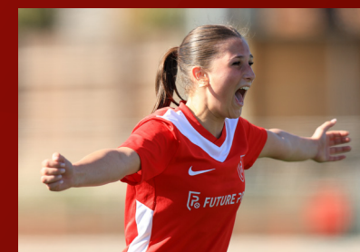
Progressed to Women's National Cup Final after win at Brighton