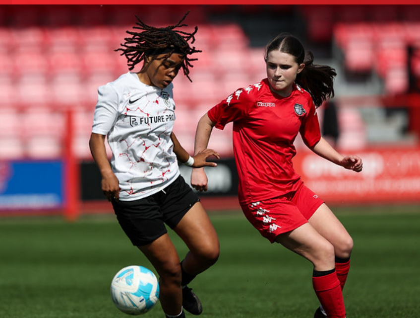
National Women's Cup Final at Accrington Stanley FC