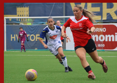
Showcase Game vs Hellas Verona Women's