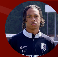
HARLEM - Bermuda