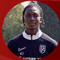
KYLANO - Antigua