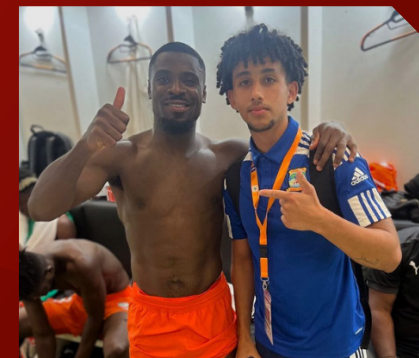
Scholar Playing Against Ivory Coast Serge Aurier