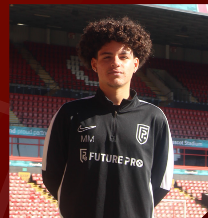
Antiguan International Trial with Walsall FC