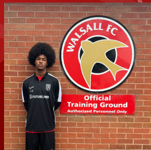
International Player on trial at Professional Club